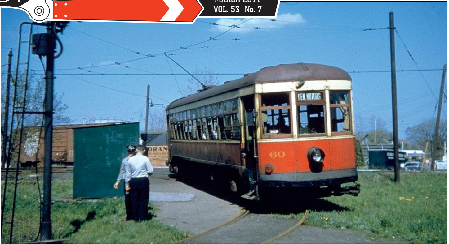
YESSIR, THAT'S MY BABY: Rochester Transit Corp. Car 60 pauses in between runs at Rowlands Loop in Brighton, on what looks like a warm summer day in June 1956. The city will have shut down the Rochester Subway by the end of the month, and the entire fleet would be scrapped—except for Car 60. Donated to Rochester Chapter after the end of service, the was finally brought to Industry in 1998 for preservation.