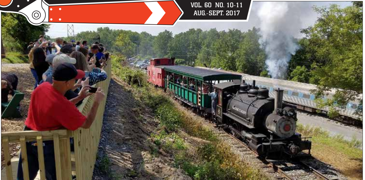
Visitors enjoy the view from the new Railfan Overlook as Viscose 6 climbs the Hill Block with another excursion train. The privately-owned steam locomotive operated two weekends on August 19-20 and 26-27, carrying more than 1,700 happy visitors who enjoyed this unique experience.