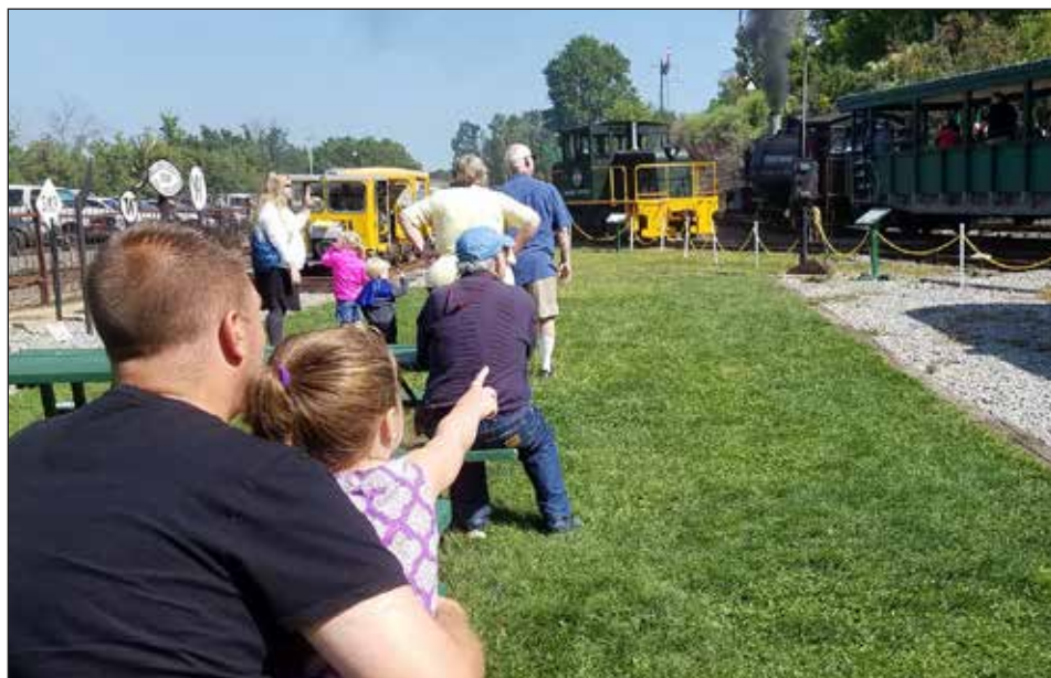
Viscose 6 put on quite a show each time it departed Industry with a train. The depot lawn provided an excellent viewing area to take in all the action throughout the event.

Get tickets at schedules at RochesterTrainRides.com