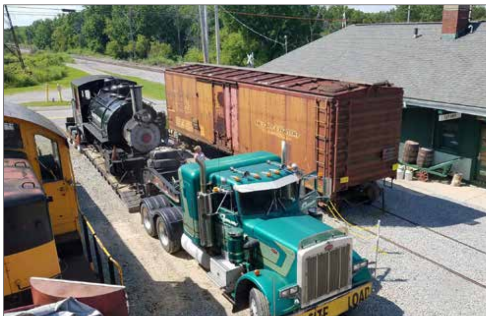
Viscose Co. No. 6 arrived on Monday, August 14. The engine is transported on a special trailer which allows the engine to be rolled on and off the tracks.