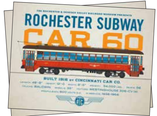
SUBWAY CAR 60 LIMITED EDITION 24x18 POSTER