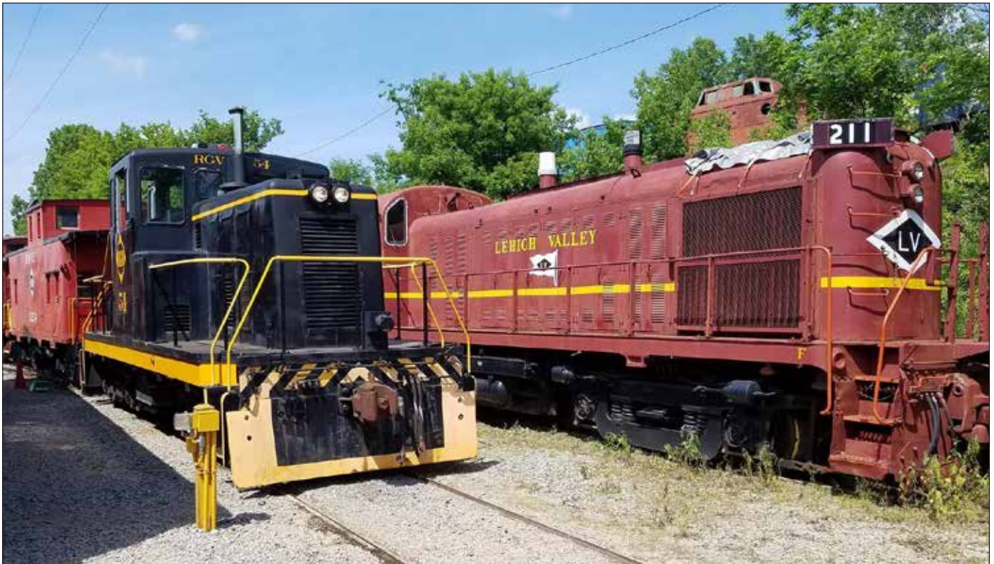
RGV 54 meets LV 211 at Industry Depot on June 17 during our Rochester Subway Heritage Weekend event. Look for LV 211 to be running in September for our annual Diesel Days.

Find us on Facebook! facebook.com/rgvrrm