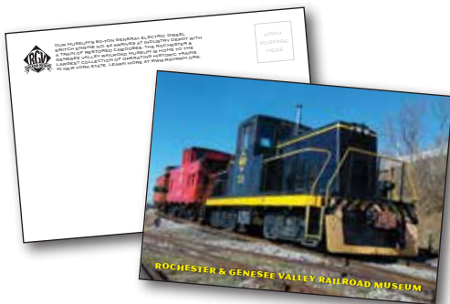
R&GV MUSEUM POSTCARDS