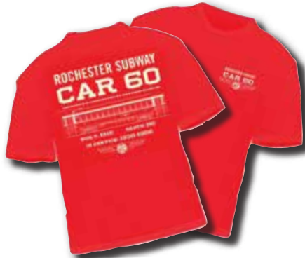
SUBWAY CAR 60 LIMITED EDITION T-SHIRTS