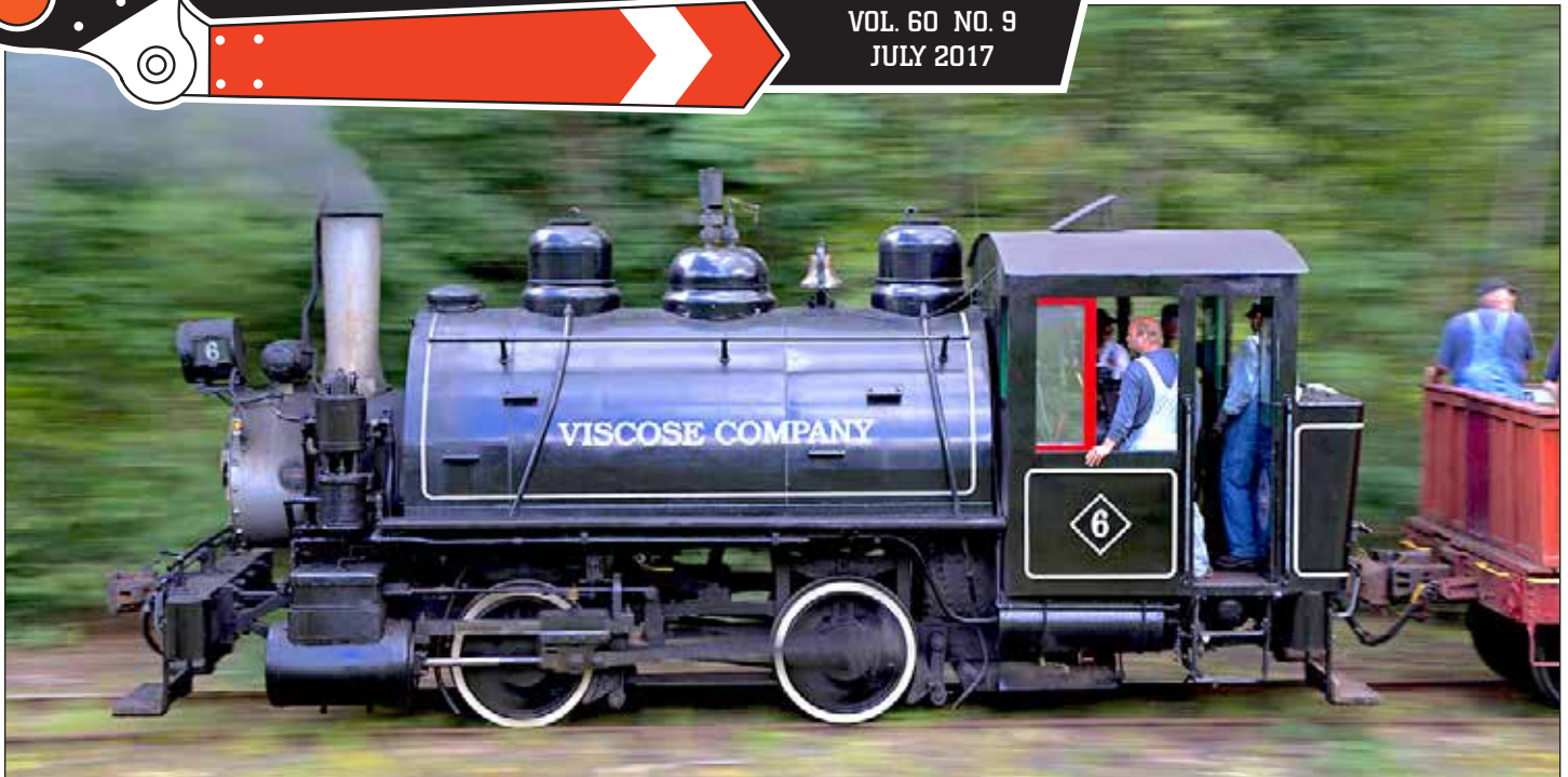
Building on a dream our organization has shared for many years, Viscose Co. No. 6 is coming to the museum for two weekends in August! This will be the first steam locomotive to operate in the Rochester area since 1954! We need your help to make this event a success.

NEXT MEETING: July 20 Enjoy rides on your museum railroad!