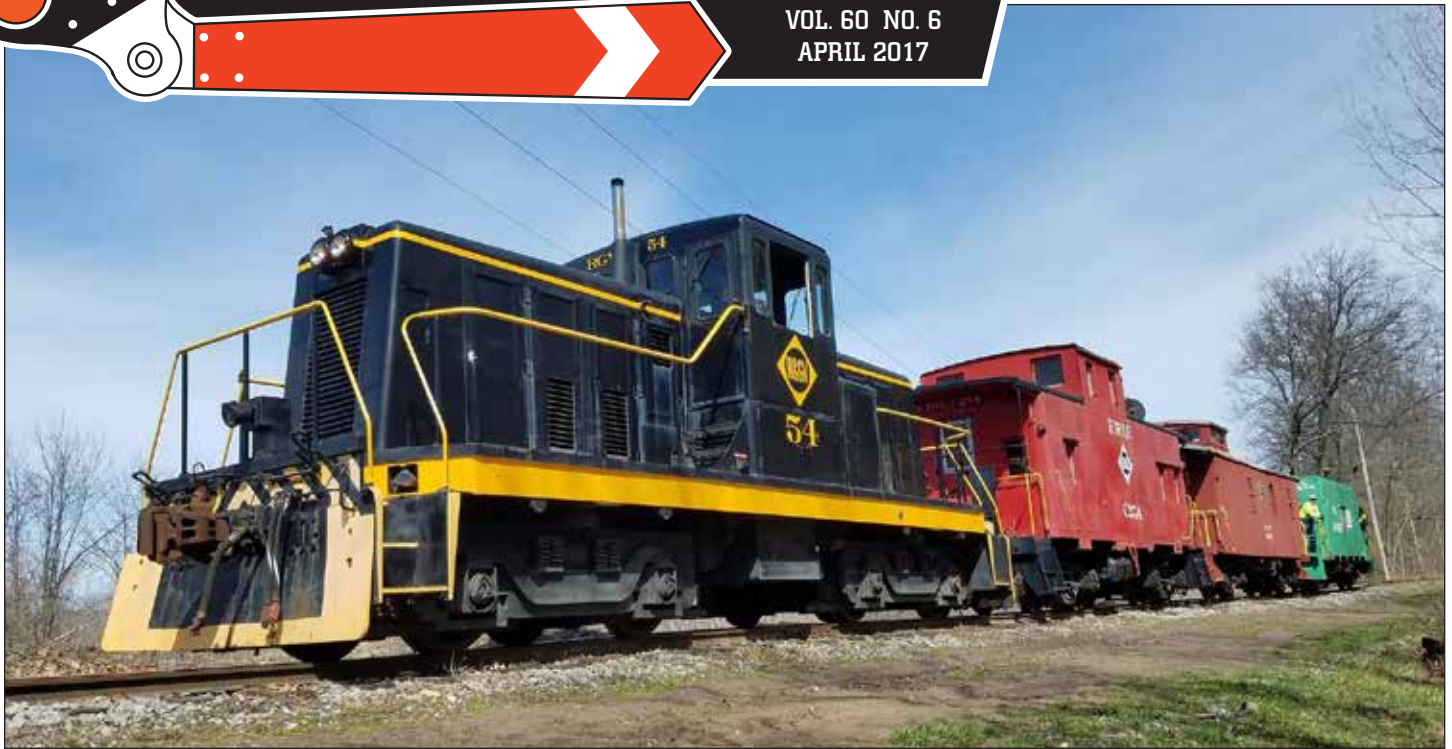
Our train pauses north of Switch 6 during our first Hands-on Training Day on April 8. Two more training days are scheduled for May 14 and June 10 to help volunteers get ready for the upcoming season of train rides.

NEXT MEETING: April 20 Bob Zimmermann presents "Cleveland 1975-1983"