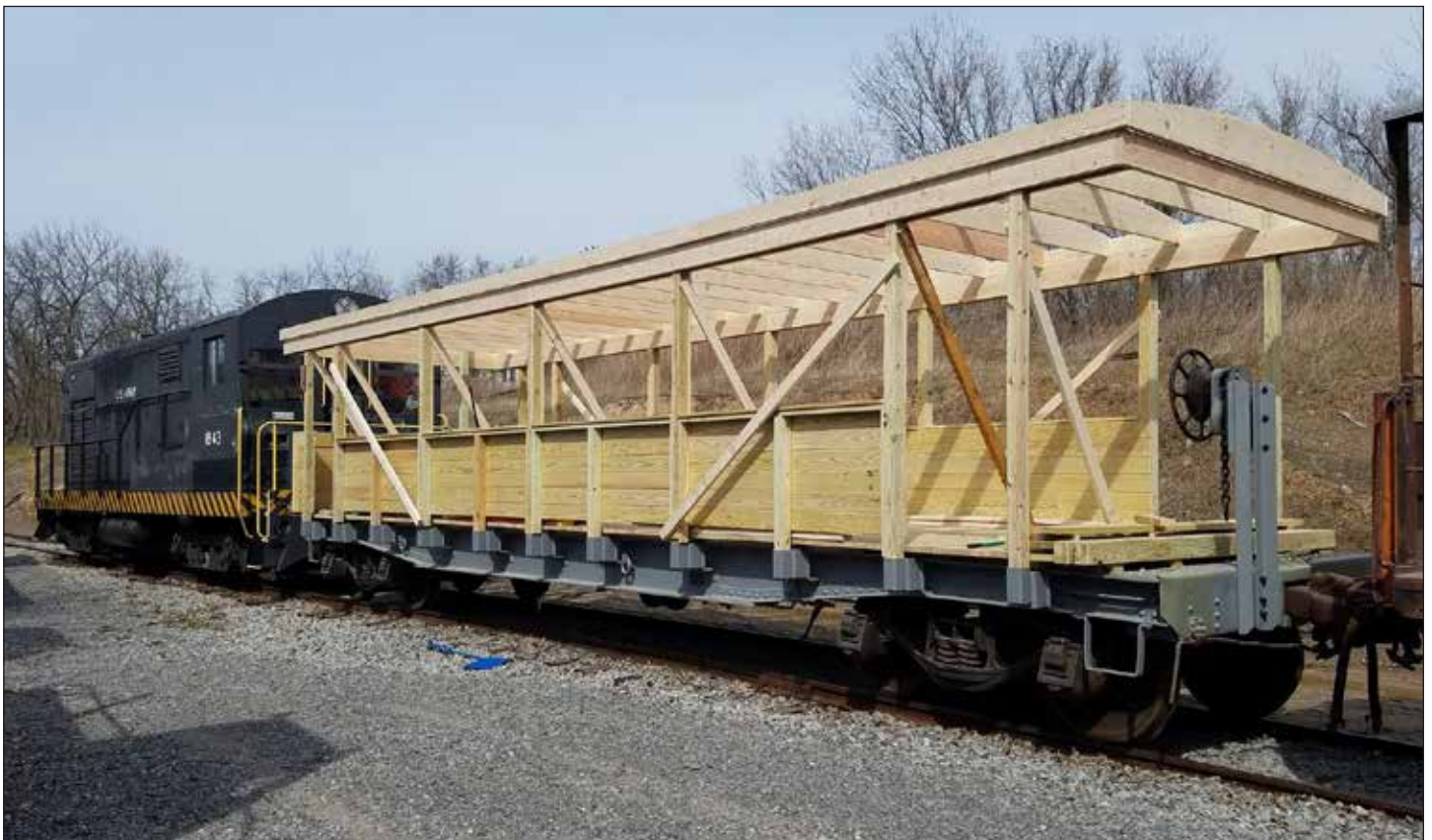
FIRST LOOK AT THE SUN: The open-air flatcar project gets its first look at the sun during some switching moves made on April 9. Built on an old 40-foot Army flatcar acquired from the Lowville & Beaver River Railroad, this open air car will be carrying visitors on our museum railroad this summer.

Find us on Facebook! facebook.com/rgvrrm