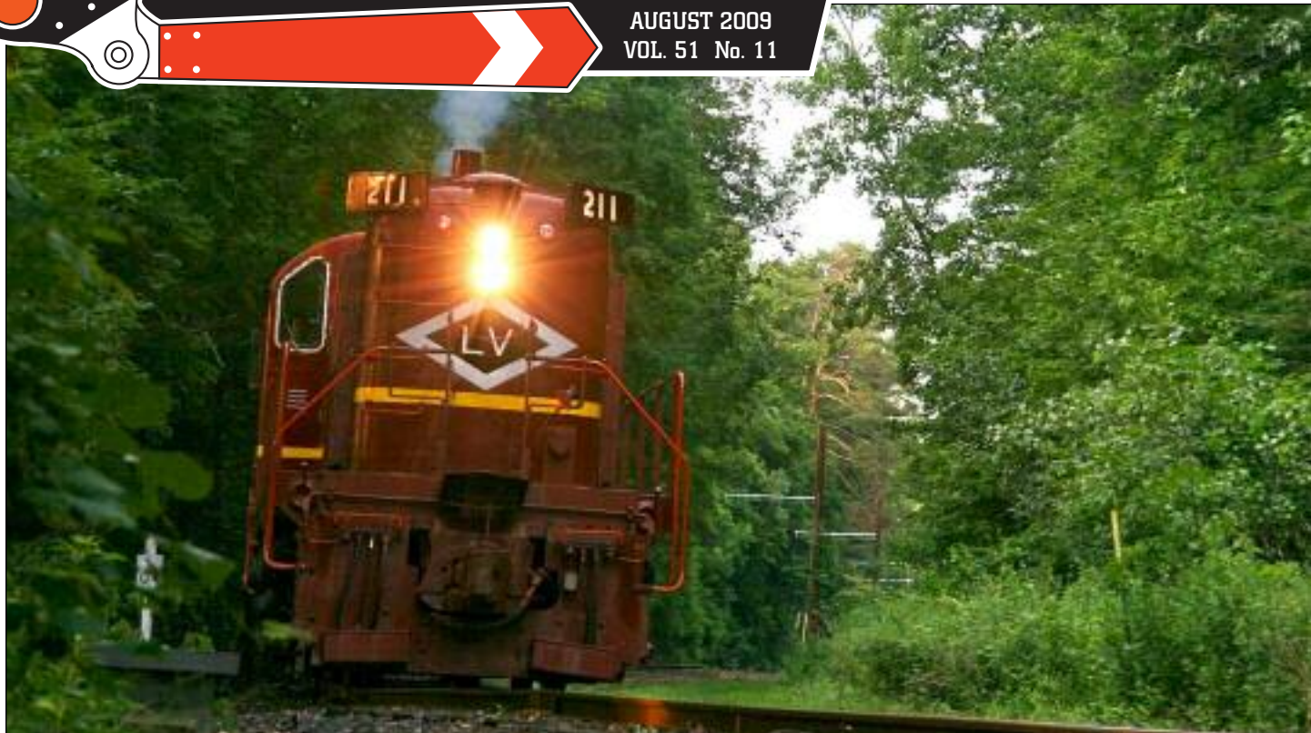
Our "Hammerhead" Alco RS-3m rounds the bend southbound at Scanlon's Curve during a photo runby during our July 2008 Chapter meeting. The distinct numberboards were replaced and restored by museum volunteer Neil Bellinger in 1990. Lehigh Valley 211 remains one of our most popular pieces of equipment, and will be one of the main attractions at this year's Diesel Days celebration August 22-23!

NEXT CHAPTER MEETING: August 20 Enjoy Your Museum Railroad! Bring a friend and enjoy a relaxing evening train ride!