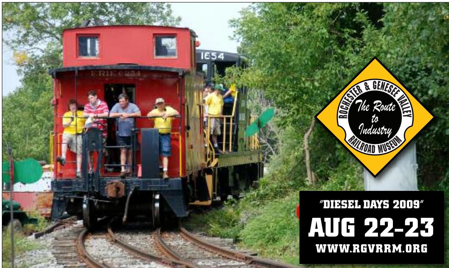
DIESEL DAYS ARE HERE AGAIN: Our former Army 80-tonner 1654 climbs the Hill Block with our restored Erie Dunmore Shops caboose during last year's popular Diesel Days event. Enjoy a ride behind our vintage diesels August 22-23, 2009. All aboard!