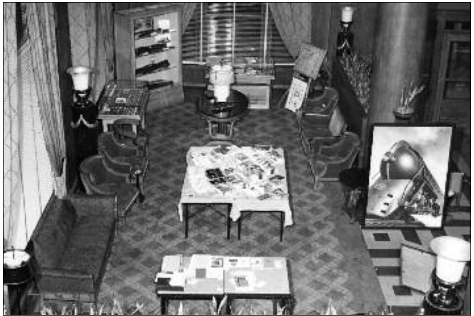
The lobby of the Hotel Rochester was stocked with model displays, photos, and railroad literature to welcome attendees of the 1949 NRHS National Convention.