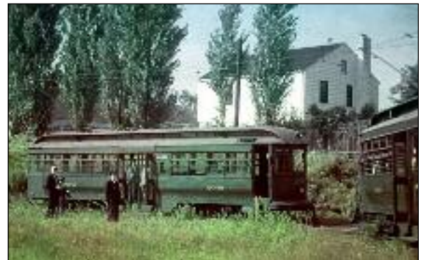
RTC 2006 and 2010 pause at Rowlands during the special chartered tour of the Rochester Subway on Monday, September 5, 1949.