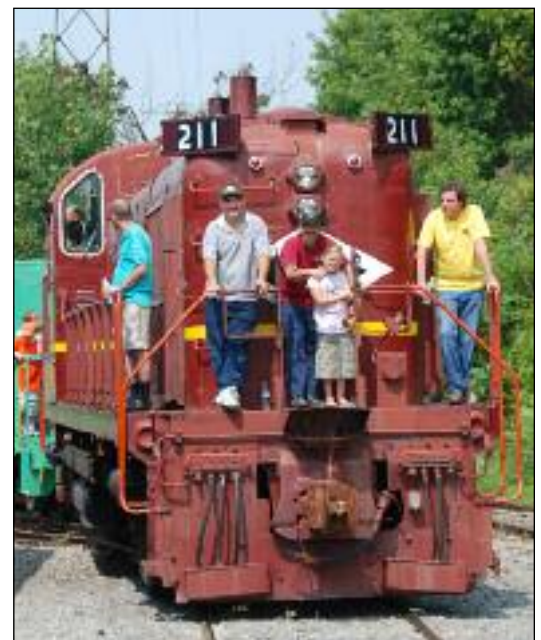
Lehigh Valley 211 arrives at Industry Depot with a full load of visitors during our well-attended 2008 Diesel Days event.

SOLD OUT! This trip has sold out, but we are taking names to put on our waiting list, in case additional space opens up. Please email for details.