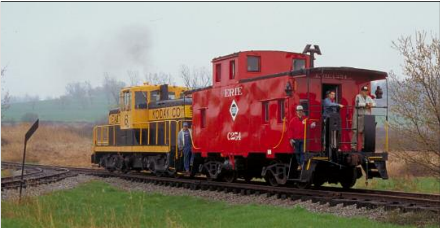
FROM THE ARCHIVES... In the spring of 1996, we find the R&GVRRM's Eastman Kodak Company #6 shoving the repainted Erie C254 up the hill toward the NYMT just north of the Loop Switch with a special trip; possibly for the local NMRA. The view here has changed a bit in twelve years with the addition of the electric overhead for the trolleys.