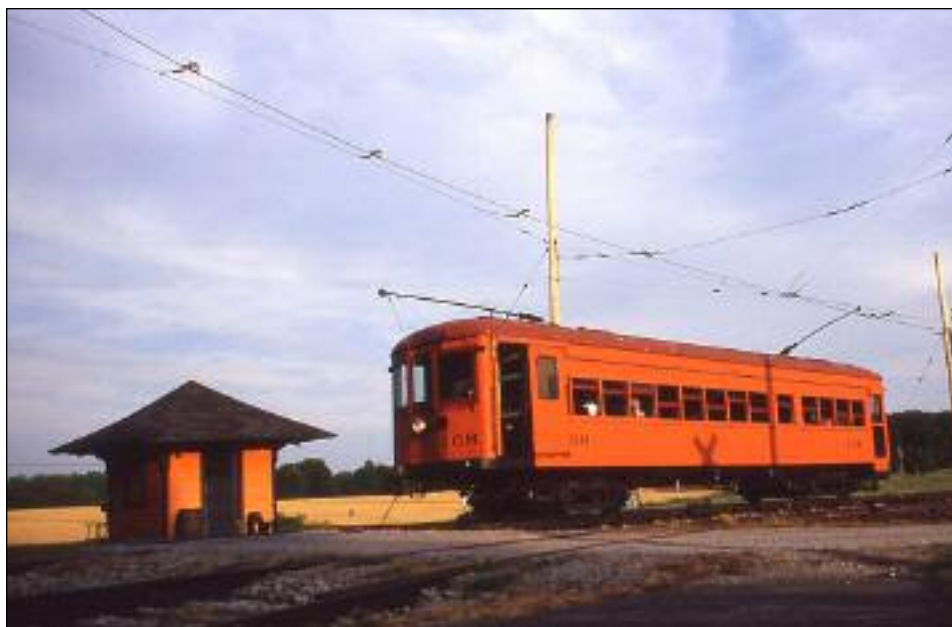
The NYMT continues their electrification expansion program. There's a very good chance we may be meeting trolleys at the Transfer Point during this year's Diesel Days.