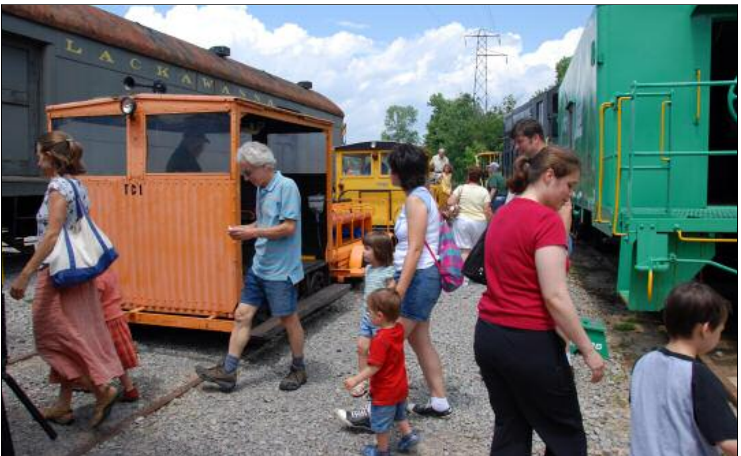
Museum visitors disembark and prepare to tour our displays and equipment. Our Depot Tour Guides help our visitors interpret our many displays and answer questions from the public. Can you spare an hour to help out one weekend this summer?