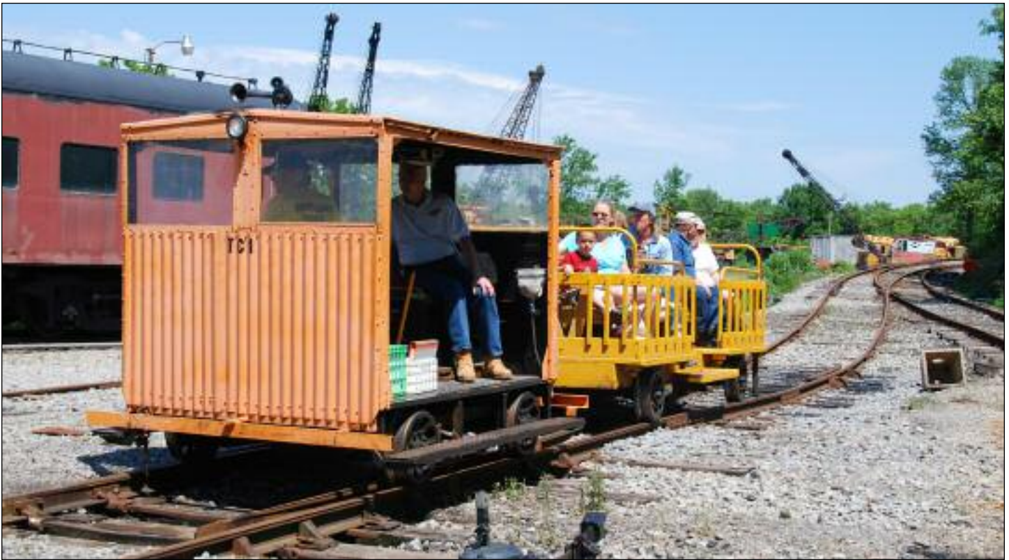
Track Car TC-1 arrives at Industry with a full load of passengers. Our track cars provide reliable shuttle service between R&GVRM and the New York Museum of Transportation, giving our visitors a pleasant two-mile ride.