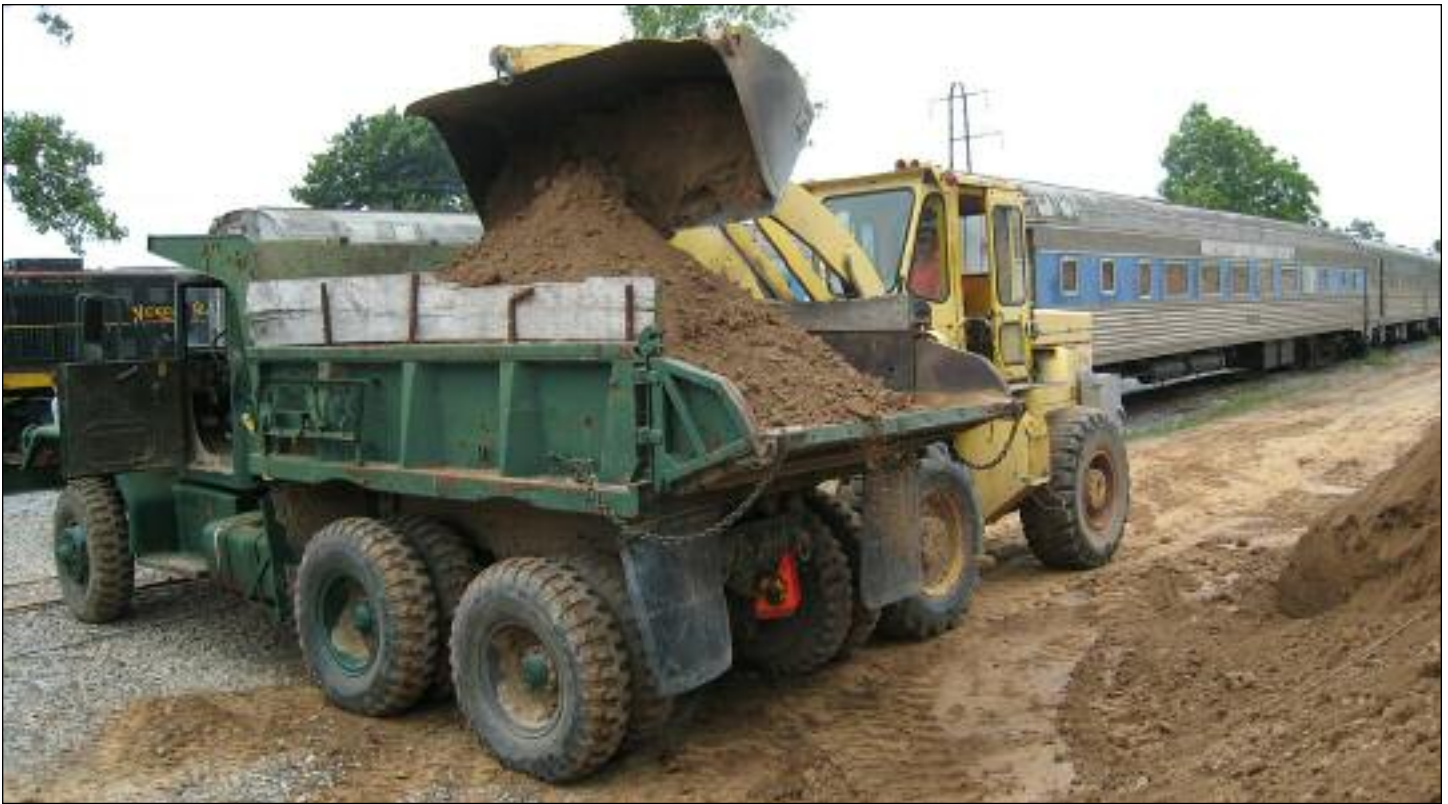
Our Construction Department remains hard at work around the museum. Here they are moving more dirt from the northeast corner of the restoration building to be used to widen the fill at the south end of the building to allow for additional track to be built south of the building.