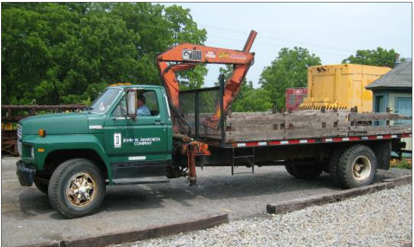
The museum was fortunate to be able to acquire via purchase a new flat bed boom truck. Thanks to footwork by Joe Scanlon and Rand Warner this useful truck was purchased and moved to the museum where it will be used for moving track parts, ties, and other materials around the museum. The purchase was made possible by the continued sale of surplus equipment from around the museum.