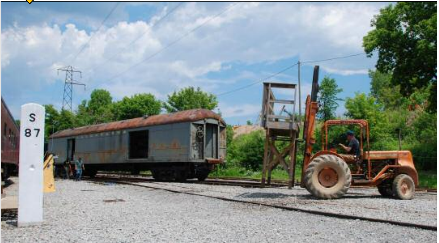
Our Lackawanna baggage car full of displays was relocated to Track 3 to allow better access to Track 5. Our Ford forklift helps move the heavy wooden staircase that allows our visitors to visit the displays inside the car.

alive and well again. We do need operators for Caboose Days Event, July 20 and also Sundays August 3, 10 and 17. There is a good possibility that this may be the last year for regular weekend track car operation. Instead, NYMT will be running trolleys down to meet our diesel fleet. To make sure you do not miss these last operating opportunities, contact me at haroldrussell@juno.com or 585-427-9159.