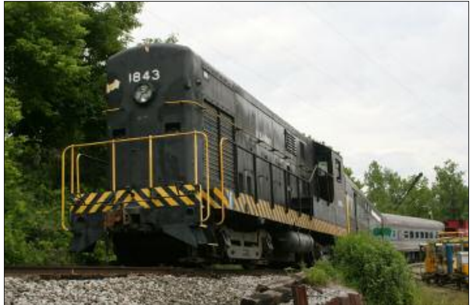
USA 1834 took charge of an RPO and coach from our stainless excursion set for rides up to the Transfer Point during our June Chapter Meeting at the museum. Everyone enjoyed riding the coach, probably the first time this had been attempted in 20 years.

RG&E 1941: Work on 1941 has continued. The locomotive’s Number 2 headlight was scrapped, re-lamped, re-installed and made operational. It was discovered that the muffler on the Number 2 end was subject to the same problems that had led to the failure of the number 1 engine due to water intrusion. It was decided to remove the muffler on the Number 2 engine, clean up the muffler pocket in the hood and take corrective measures to prevent future water infiltration into these areas on both ends. Work continues on mounting the remaining windows. We are in need of a volunteer with brazing skills to make patches in the window frames. There are some issues with the throttle linkage that had been modified by past owners. The throttle linkage will need to be adjusted to bring it back to the original design settings. RG&E 1941 has been used recently to move equipment in and around the