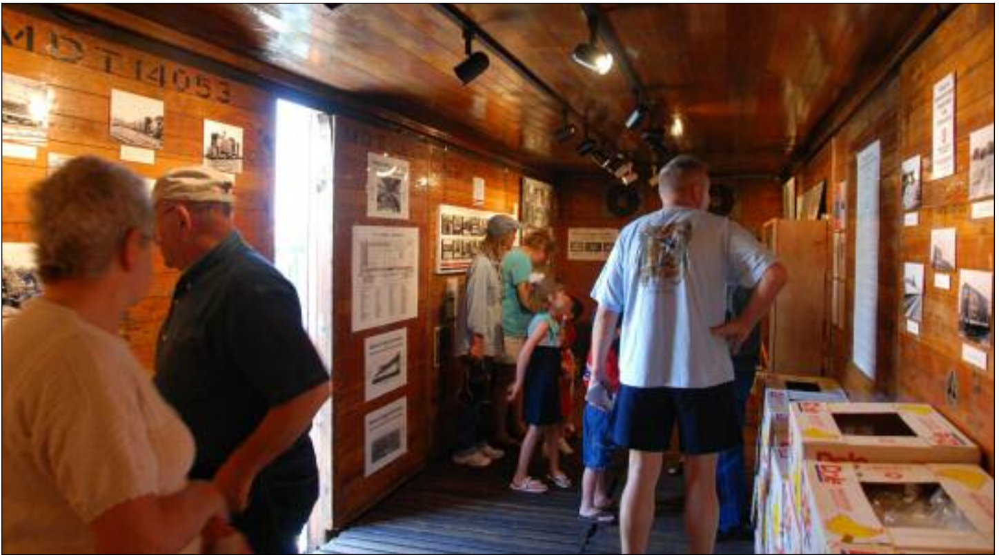
Visitors enjoy the historical displays inside our former Merchants Despatch Transport reefer (MDT 14053). The display describes the carbuilding activities that once took place at Despatch Shops, Inc. in East Rochester, a subsidiary of the New York Central. Cars like our MDT reefer were built at DSI. Penn Central closed DSI in 1970. Chris Hauf put together the informative displays.