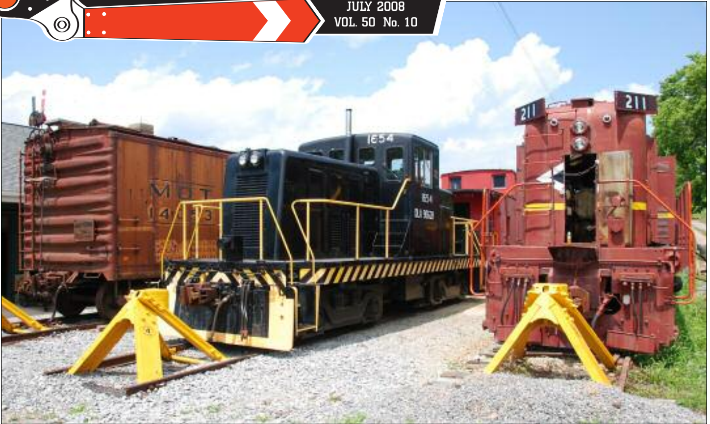
A fresh lineup at the bumping blocks at our Industry Depot greets passers-by on Route 251! From left to right, MDT reefer 14053 (Pacific Car & Foundry), R&GV 1654 and our Erie caboose, and LV 211. The Lackawanna baggage car has been repositioned behind the MDT reefer to allow better access to Track 5 for additional equipment. Our volunteers made it happen!

NEXT CHAPTER MEETING: JULY 17 Enjoy Your Railroad! Bring your friends to Industry Depot to enjoy a ride on our museum railroad!