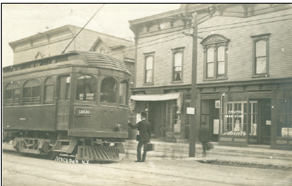
Rochester, Syracuse & Eastern Interurban car at Macedon, NY

Certainly applies to the last 35 years of dreams turned into operational reality at R&GVRRM.