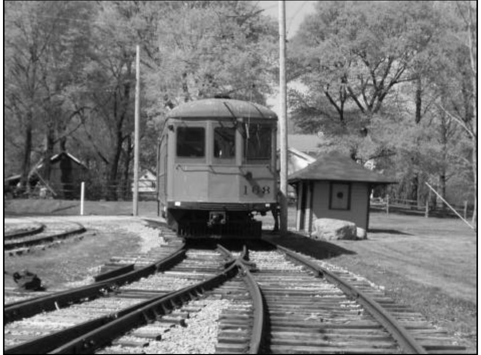
P&W Car 168 waits to enter the NYMT car barn after a training run.