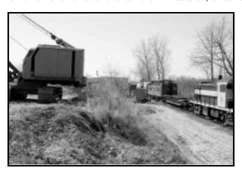
Before the Big Dig: On April 16, 2005, there was still a mountin of dirt to be moved at the north end of the building as only Restoration Building's roof can be seen over the dirt in this shot looking south.

With the goal of connected track to our Restoration Building this Fall, our volunteers have been working hard to finish moving a mountain of dirt from the north end of the building and filling in on the south. You have seen the updates here in The Semaphore of the progress over time, but here are some signs that enough dirt will have been moved to start laying the tracks on the north end and after the fill settles, extend the tracks out of the south end of the building.