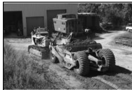
The Cat D8 tractor pan heads around the north end of the Restoration Building as it heads to the south end to dump a full load of dirt on the fill.

Fortunately we did not get the anticipated heavy rains and did not sustain any water damage.