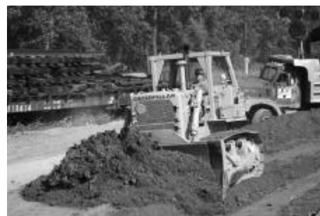
Joe Scanlon runs the D7E dozer through the excavation area to move some additional dirt into place for the Cat D8 tractor pan to pick up on its next trip.