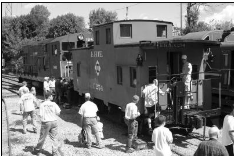
Diesel Days visitors board Erie caboose #C254 and F-M USA #1843 in the R&GV Railroad Museum's Industry yard.