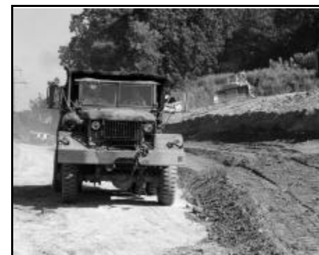
Mike Roque' takes a full load of dirt off to the fill area in one of the museum's former military 5-ton dump trucks.