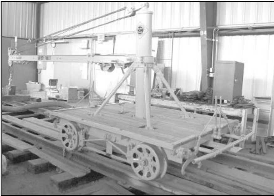
The Museum's Fairmont track crane, after some heavy steel work, sports a new wood deck and yellow paint. Note the addition of lettering and R&GVRR Museum logos.