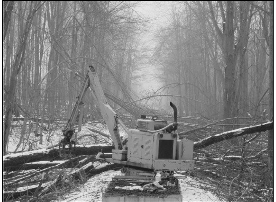
OMID crews work to clear ex-PRR section of mainline of fallen trees following the April 3-4 Ice storm which devastated much of Wayne and Monroe Counties.

All classes are to start at 9 AM and will be held at the NYMT