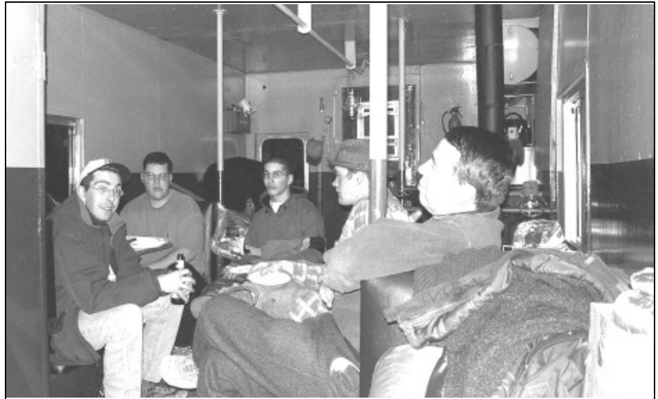
"Campers" enjoying a night out in one of the Museum's cabooses.